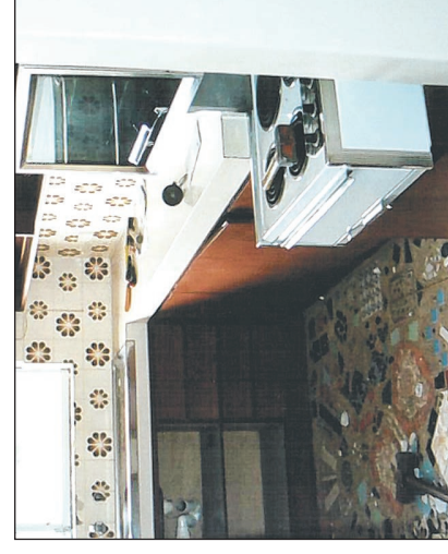
The kitchen in its two incarnations: before the makeover and the polished, finished version.

Matthew installed new doors, many with frosted glass panes to maximise the light.