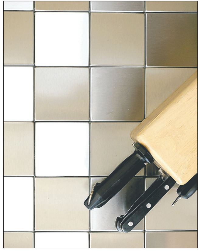
Square tiles of pressed steel give a subtle, chequered effect in the kitchen.

This is the sixth house the couple have restored and, with its sandstone, soft blues and aquas, pearly silvers and pale coffees, it's their favourite to date.