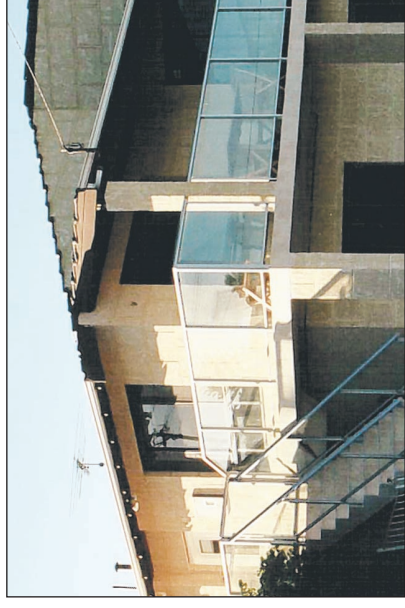
Now and before: the red brick with a tiled roof was replaced by limestone teamed with a grey slate roof.