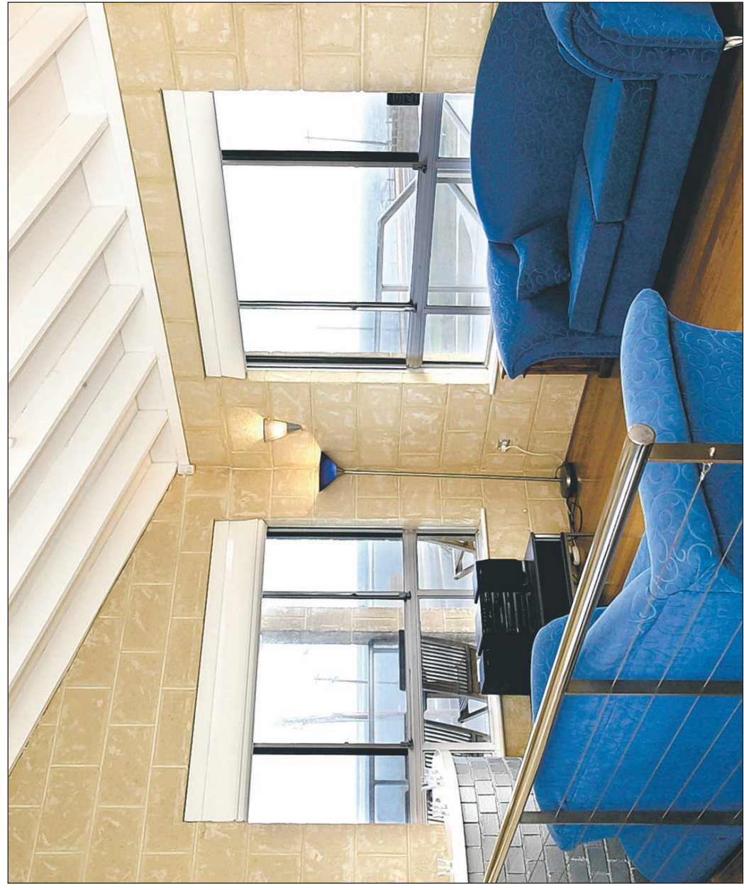
Blue sofas and limestone walls reflect the seaside mood in the makeover.

A house nobody wanted is now a highly desirable residence.